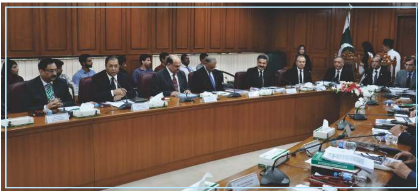
Meeting of the Police Reforms Committee, Chaired by Hon'ble Mr. Justice Asif Saeed Khan Khosa