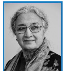
Ms. Khawar Mumtaz Chairperson National Commission on the Status of Women