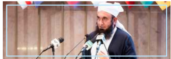
The renowned religious scholar, Maulana Muhammad Tariq Jameel also addressed the participants of symposium

the government was planning to plant ten billion trees in the country in the next five years for betterment of the environment. He also emphasized upon the need to include the subject of environment and population planning in school curricula.