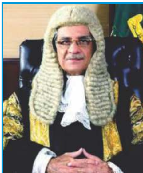
Hon'ble Chief Justice of Pakistan Mr. Justice Mian Saqib Nisar Chairman LJCP