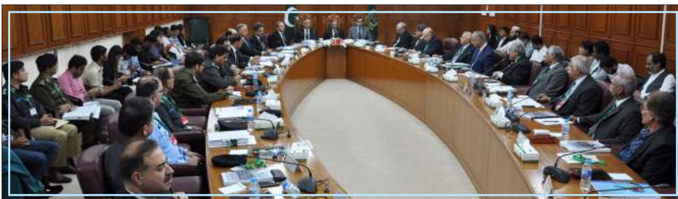
Hon'ble Chief Justice of Pakistan Mr. Justice Mian Saqib Nisar and Hon'ble Mr. Justice Asif Saeed Khan Khosa during meeting of the Police Reforms Committee

transgender community. Accordingly, the Secretariat has arranged various meetings with the representatives of NADRA, Provincial Social Protection Authorities, Social Welfare