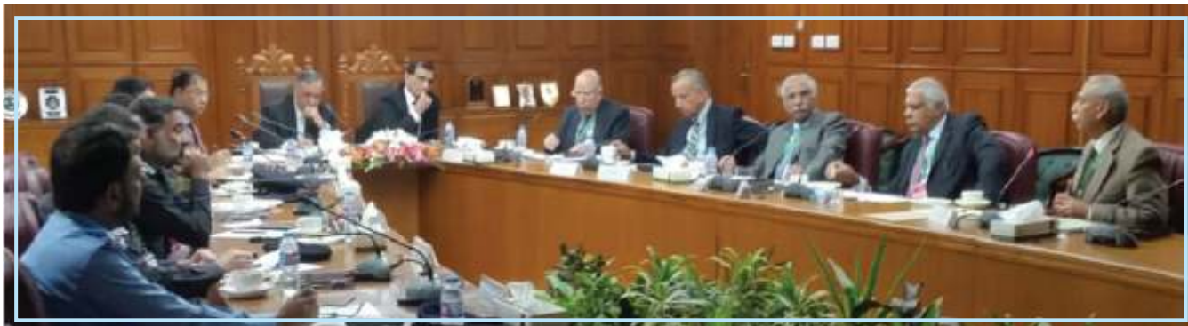
Meeting of the Steering Committee on Police Reforms Chaired by Hon'ble Mr. Justice Asif Saeed Khan Khosa

In its first meeting held on 29th October, 2018, the Steering Committee on Police Reforms has deliberated upon the way forward for the effective implementation of recommendations contained in the Report. The Committee suggested the following steps: